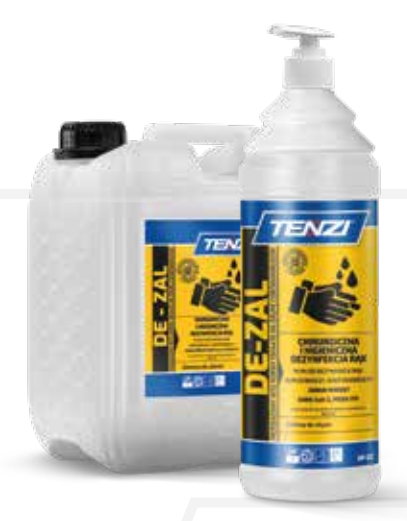
1 dose = 1 ml